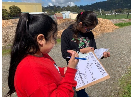
Image 4 (Right Image) – Students apply their scientific skills, observing their surroundings and labeling and drawing three species of plants and three species of animals they see in Pickleweed Park. The learning objective was for students to apply their knowledge of the four parts of a wetland (upland, tidal marsh, mudflats, and open bay) to determine what adaptations species may have to be able to live in certain parts of the wetland.