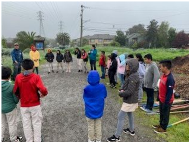
Image 2 – Opening Circle for students at Pickleweed Park Trash Clean-Up and Weeding Day. Students learned how all storm drains in Marin discharge trash and pollutants to the nearest creek or bay and worked to eliminate trash from going directly into the Bay! The tools the students will need are to the right of the image, using shovels, trowels, scrapers and buckets to prevent pollutants from further entering their watershed.