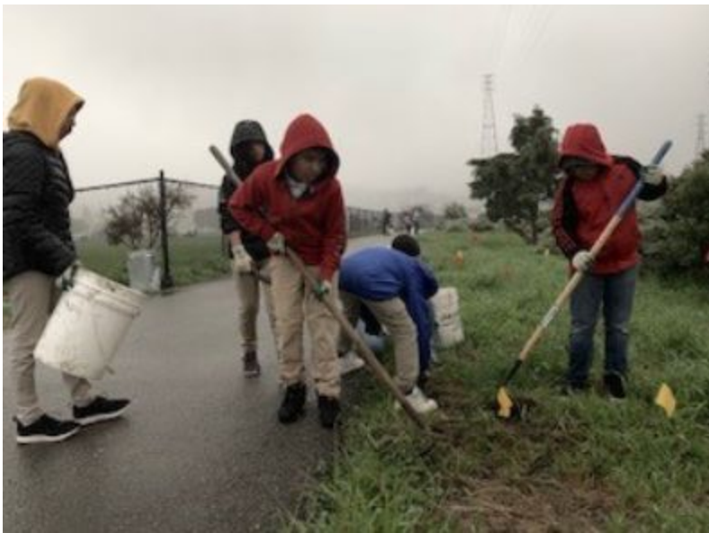
Image 9 – A team of students work together in a misty morning to protect their selected native plant, the mist and occasional rain seeming to be the highlight of the students' experience outside.