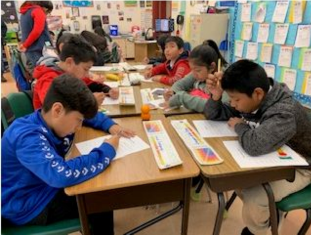
Image 1 – Students finish their post-assessments, the same assessment they received in the beginning of their first lesson to determine their growth in watershed ecology knowledge.

Below are photos of Multi-visit program students from Bahia Vista Elementary School throughout their lessons and their Trash Clean-Up and Weeding Day at Pickleweed Park.