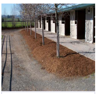
Application of compost on site.

nually on horse feeds. Manure also has an economic value in terms of fertilizer. Using estimations derived from a 1,000 pound horse generating 0.75 cubic feet of manure daily, the hypothetical amount of total-nitrogen produced can range from 100-110 pounds annually, phosphorus 30-34 pounds, and potassium 90-95 pounds annually. This equates to a value estimated at approximately $50 annually. Of course