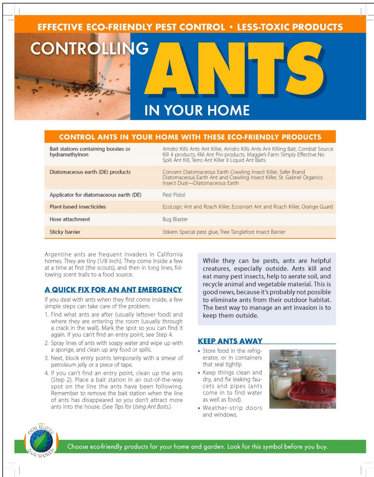
Figure A2. Ant Fact Sheet